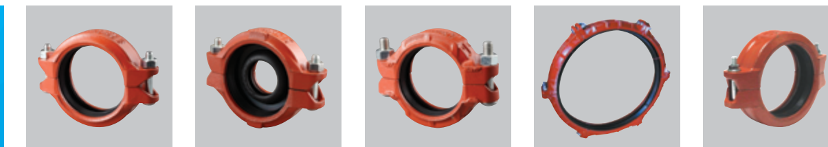
#7705 Flexible Coupling 1" ~ 12" #7706 Reducing Coupling 1½" x 1¼" ~ 8" x 6" #7707 / #7707N Heavy Duty Flex. Cplg. ¾" ~ 12" / 14" ~ 26" #7707L Large Dia. Coupling 14" ~ 42" #R20 Butt-Joint Rigid Coupling 1¼" ~ 12"