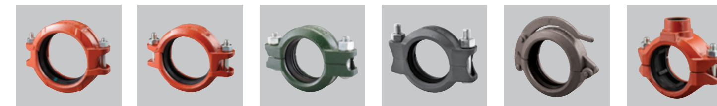
#Z05 Angle Pad Rigid Cplg. 1¼" ~ 8" #Z07 / #Z07N Heavy Duty Angle Pad Rigid Cplg. 1¼" ~ 12" / 14" ~ 24" #XH-1000 Extra Heavy Rigid Cplg. 2" ~ 12" #XH-70EP Extra Heavy End Protection Rigid Cplg. 2" ~ 12" #G-28 Hinged Lever Coupling 1½" ~ 10" #C-7 Outlet Coupling 1½" x ½" ~ 6" x 2½"