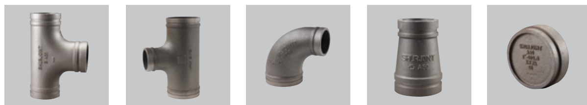
#A20 Tee 3" ~ 12" #A25 Reducing Tee 4" x 3" ~ 12" x 10" #A10R Reducing Elbow 4" x 3" ~ 12" x 10" #A50 Concentric Reducer 4" x 3" ~ 12" x 10" #A60 Cap 3" ~ 12"