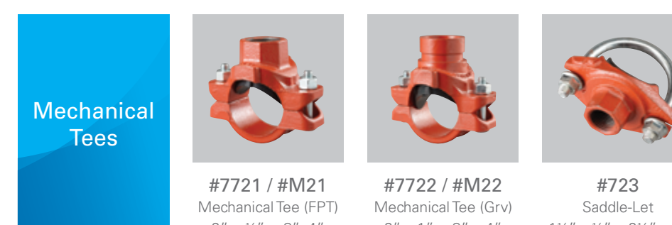
#7722 / #M22 Mechanical Tee (Grv) 2" x 1" ~ 8" x 4" #723 Saddle-Let 1¼" x ½" ~ 2½" x 1"