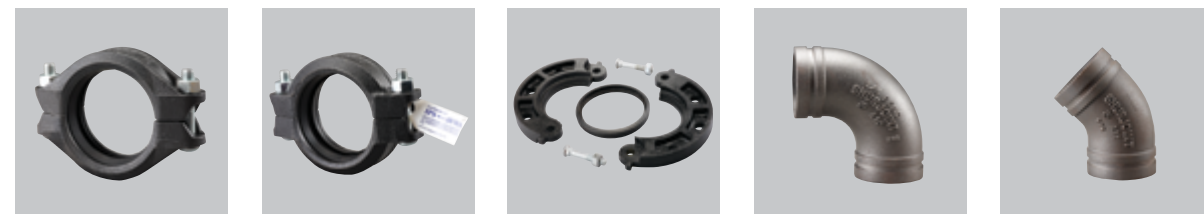
#A505 AWWA Coupling 3" ~ 12" #A507 Transition Coupling 3" ~ 12" #A512 Flange Adapter 3" ~ 12" #A10 90° Elbow 3" ~ 12" #A11 45° Elbow 3" ~ 12"