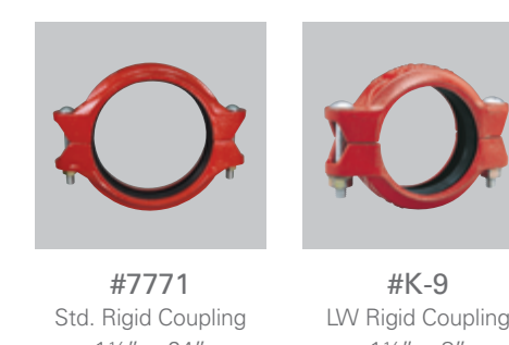
#7771 Std. Rigid Coupling 1½" ~ 24" #K-9 LW Rigid Coupling 1¼" ~ 8" #7721 / #M21 Mechanical Tee (FPT) 2" x ½" ~ 8" x 4"