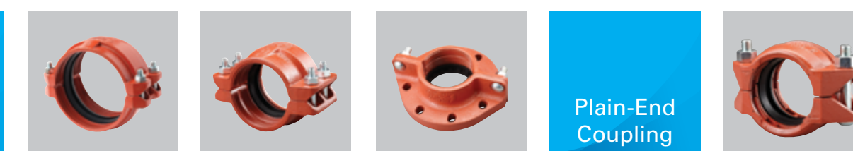
#H305 (IPS/ISO) HDP Coupling 2" ~ 20" (50mm ~ 450mm) #H307 (IPS/ISO) HDP Transition Cplg. 2" ~ 12" (63mm ~ 315mm) #H312 (IPS/ISO) HDP Flange 3" ~ 12" (63mm ~ 315mm) #79 For IPS Steel Pipe WILDCAT Coupling 1" ~ 16"